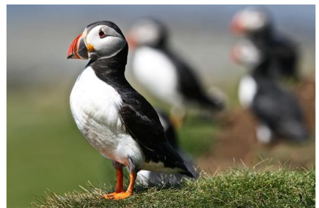
From top: Guillemots, Otter & Atlantic Puffins